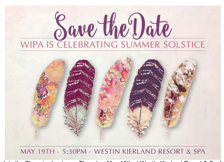
Join the Phoenix chapter on Thursday, May 19th at Westin Kierland Resort & Spa!