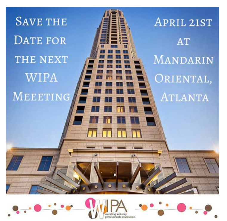
Join WIPA Atlanta on April 21st at the Mandarin Oriental for their next event!